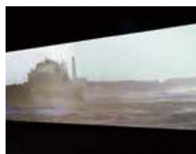
Records from the Great East Japan Earthquake and Tsunami (Video)