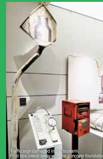
Traffic sign damaged in the tsunami. Post box swept away with the concrete foundation