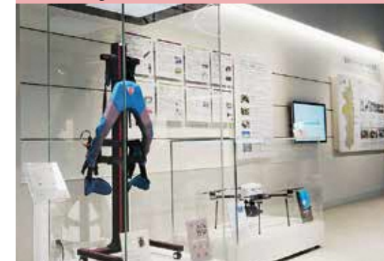
Explanation about the initiatives under the Fukushima Innovation Coast Framework, Robots made in Fukushima

This section demonstrates how Fukushima has overcome adversity while revitalizing itself. By sharing the progress made in decommissioning work and initiatives such as the Fukushima Innovation Coast Framework, we show how the people of Fukushima have been facing difficulties and moving forward towards revitalization.