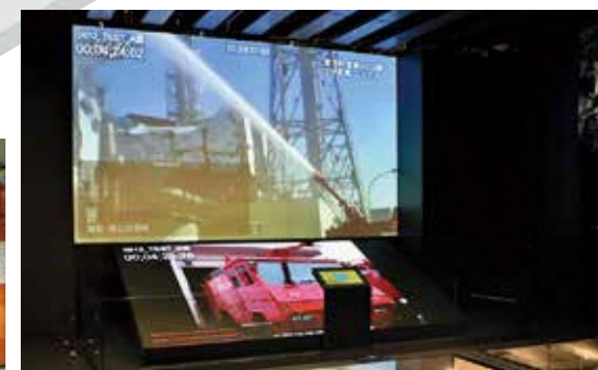
Retracing the one week period of the accident (video)