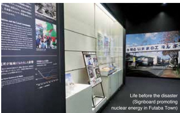
Life before the disaster (Signboard promoting nuclear energy in Futaba Town)

By effectively combining video and animation of the earthquake, tsunami, and nuclear accident, this exhibit demonstrates two guiding principles: "Think of the disaster as affecting everyone," and "Pass the experiences and lessons of Fukushima to future generations." This is a gateway to help people to think about the disaster, the nuclear accident, revitalization and the future.