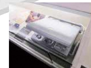
Ultrasound machine used for thyroid examinations

Through commentaries on touch screen panels and documents, we convey how Fukushima residents have been dealing with prolonged and difficult challenges caused by the nuclear disaster. These include decontamination (removal of radioactive materials), dispelling harmful rumors, dealing with long-term evacuations and health-related efforts.