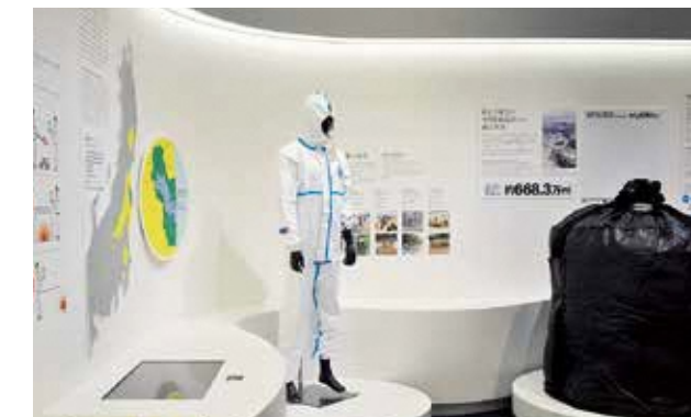
Decontamination (protective clothing and flexible container bag)