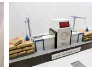
Model of a machine used to screen radiation of rice in all bags