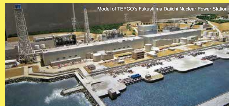
Model of TEPCO's Fukushima Daiichi Nuclear Power Station

After experiencing the unprecedented compound disaster, Fukushima has been making progress towards revitalization. The records and memories of Fukushima will be passed down to future generations as lessons to help with disaster reduction/prevention.