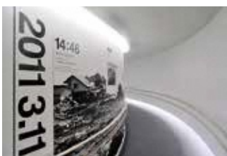
Timeline of the Great East Japan Earthquake and the Nuclear Disaster

The earthquake and tsunami on March 11th of 2011, and ensuing power station accident changed the peaceful daily life of residents. How did residents respond after the compound disaster? You can see in chronological order the situations before, during and after the disaster. You will get a detailed picture of how the compound disaster unfolded through various documents, testimonial records, and accident investigations.