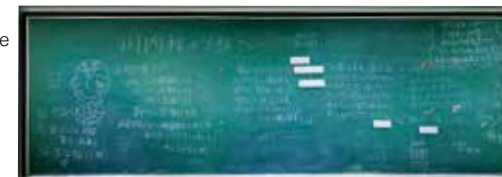
Thank-you notes on a blackboard which evacuees from Tomioka Town left at a school in Kawauchi Village