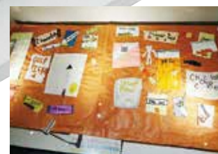
Messages of encouragement from overseas