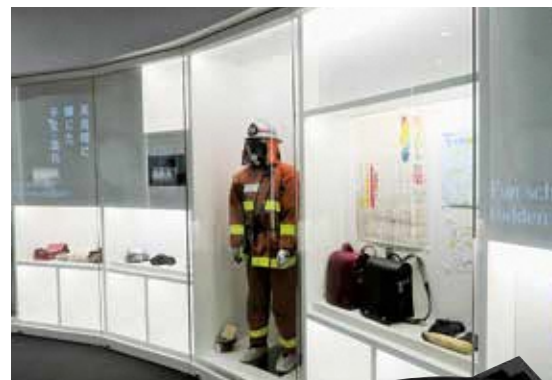
Protective clothing for firefighters, School bags and supplies left at school

How did the peaceful daily life of residents change due to the compound disaster? We share the thoughts and feelings of residents through testimonies and documents. In particular, we focus on unique circumstances associated with the nuclear disaster such as the wide-area and long-term evacuations and the harmful rumors affecting every sector of the Prefecture.